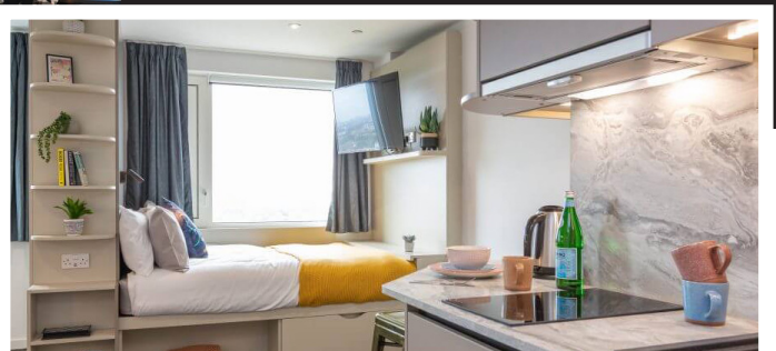
Firechief Kitchen Stove Guard installed in a Gold Studio apartment in the Vega development

Client: Downing Property Services Architect: T P Bennett Structural Engineer: Walsh Associates M&E/ Sustainability Engineer: Hoare Lea Landscape Architect: Optimised Environments Ltd Electrical Contractor: HE Simm Fire Consultant: Omega Fire Engineering Limited